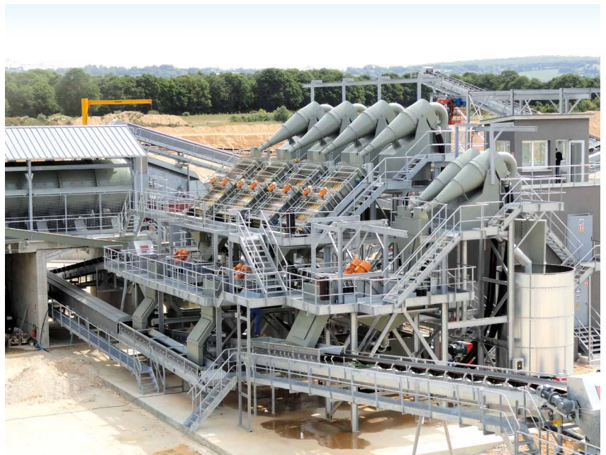
Sand treatment unit with redialing sand and grading cut.