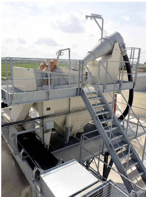
Single stage sand treatment unit.